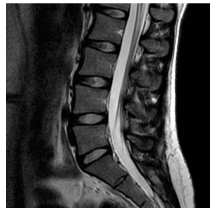
Figure 3. MRI of the lumbar spine.