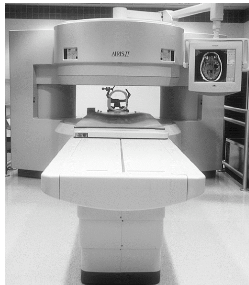
Figure 5. Viewed from the front, an open MRI resembles a bagel more than a donut, allowing the person being scanned more room.