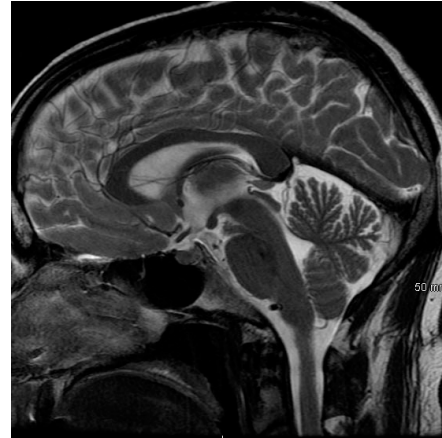
Figure 1. MRI of the brain.

MR angiogram (MRA). MRI can be used to view arteries and veins. Standard MRI can't see fluid that is moving, such as blood in an artery, and this creates "flow voids" that appear as black holes on the image. Contrast dye (gadolinium) injected into the bloodstream helps the computer "see" the arteries and veins. Contrast is also used to view tumors and arteriovenous malformations (AVMs).